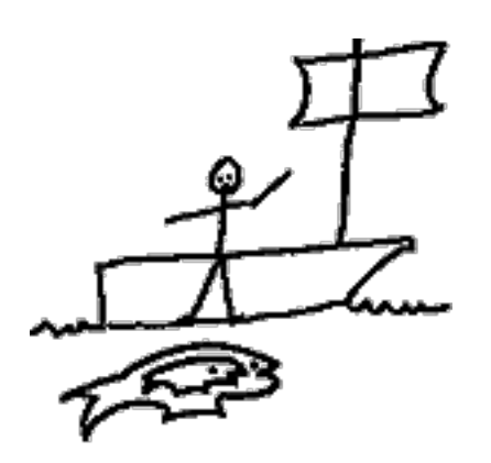
X-ray drawing, man in boat, fish in fish

Cave artists used a somewhat similar technique, the "palimpsest" or overlapped image. The overlapping may have been accidental, or intentional, indicating ritual relationships or time sequences; the animal placed in front may have been more important or one animal may have been more numerous at a certain time of year or one animal may have been painted simply at another time.